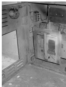
Electric arcs are extremely hot. People within several feet of an arc can be severely burned.