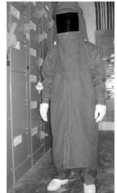
An approach based on a detailed arc hazard assessment helps to ensure that PPE is appropriately rated for exposures.